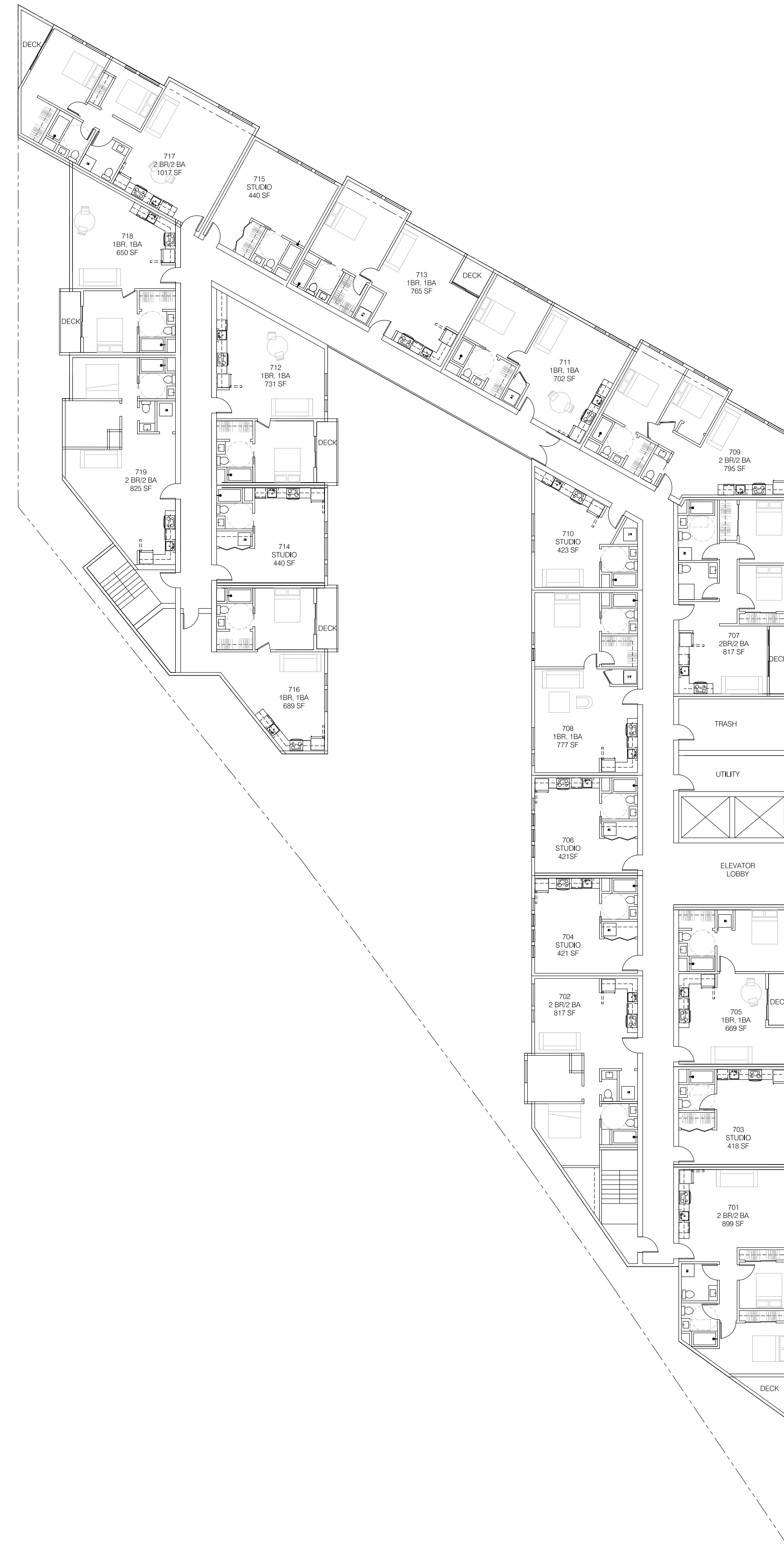
1 7TH FLOOR PLAN 1/16" = 1'-0"